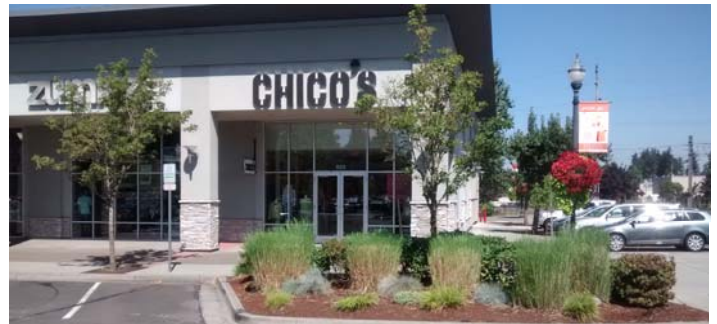
Existing retail in Gresham Station Shopping Center