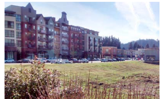
Development opportunity near Civic Drive MAX station.

That includes creating design guidelines and standards for Civic Neighborhood that are customized for the district's conditions and context.