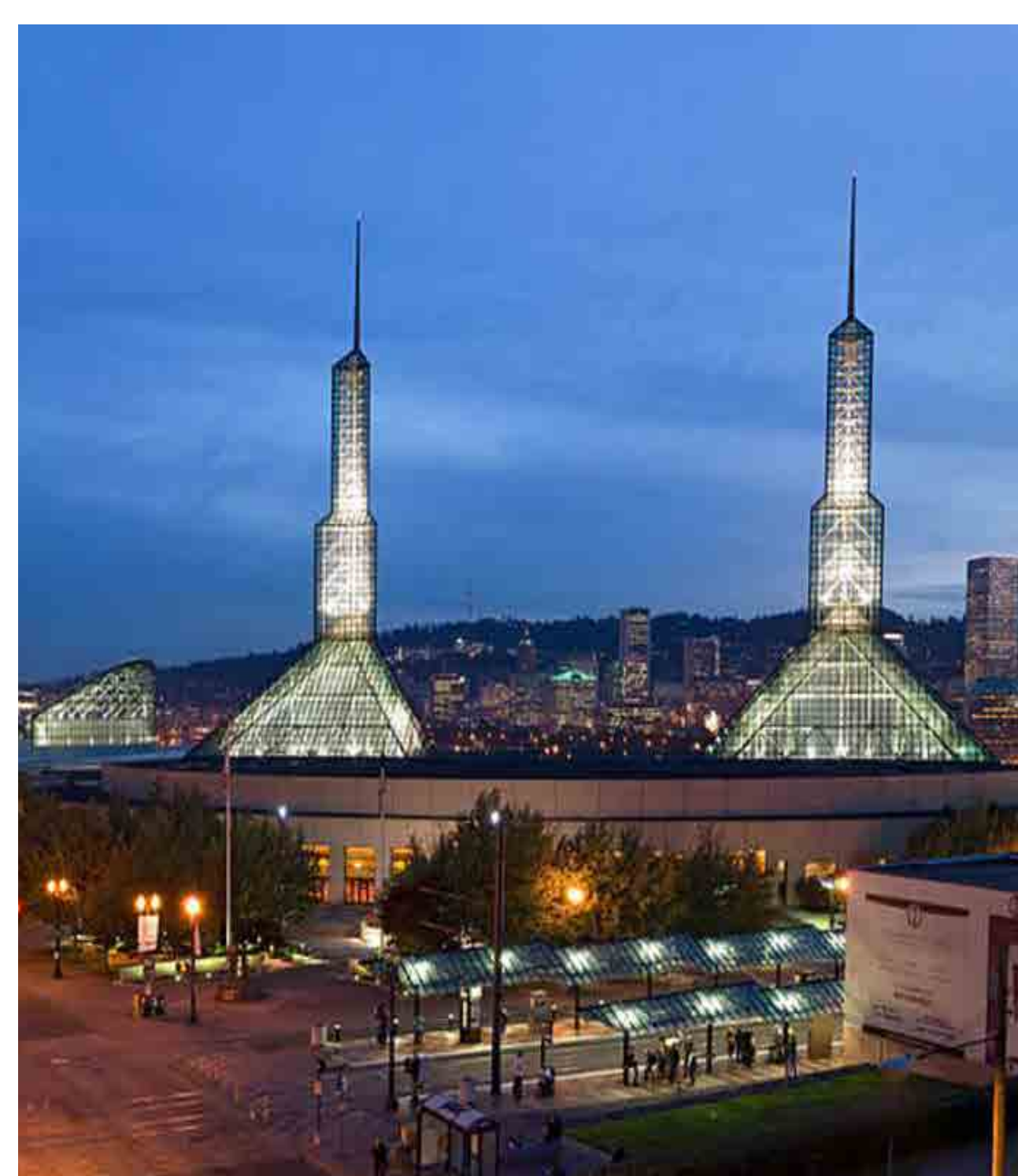
Oregon Convention Center