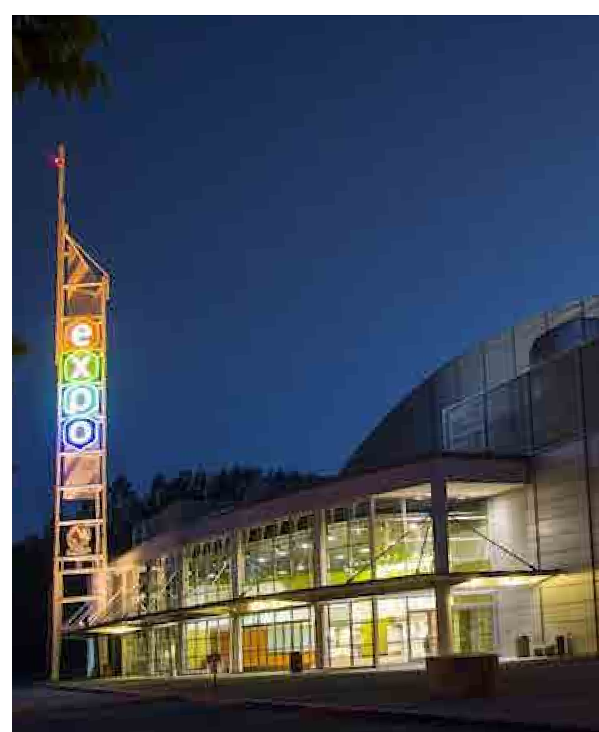
Portland Expo Center