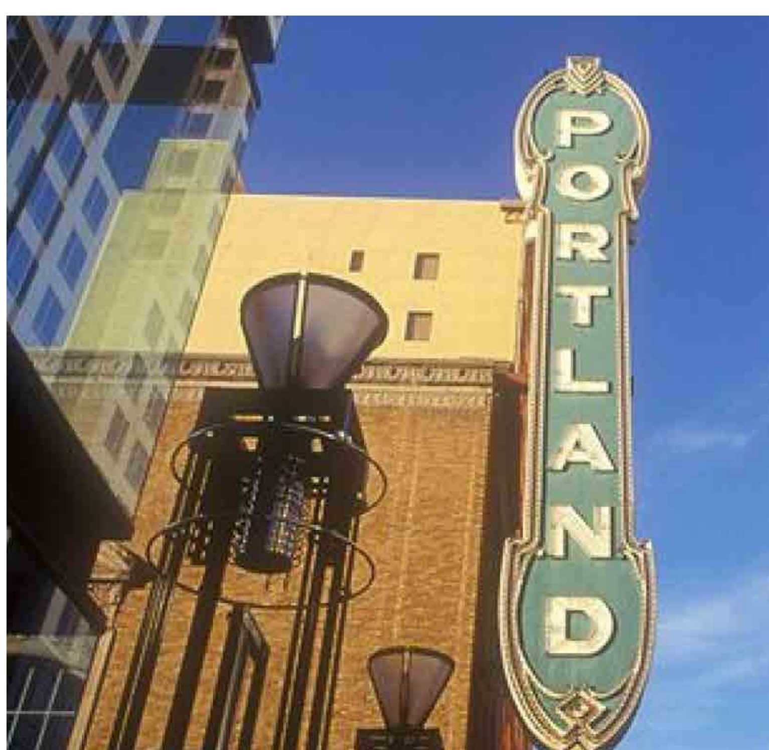
Arlene Schnitzer Concert Hall